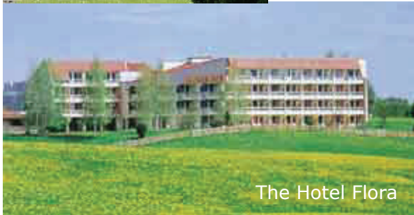
The Hotel Flora

Saturday evening features a buffet dinner at 6 PM followed by both AA and Al-Anon speakers. Following dinner is our annual sobriety count-down and raffle. Who will receive the signed Big Book this year?