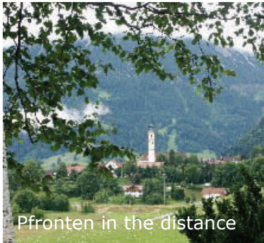
Pfronten in the distance

Registration will begin at 3:30 in the afternoon where you can sign-in, get your nametag, and pick up your first round of chances for the big raffle! The opening speaker meeting is at 7:30 Friday night . You are on your own for dinner - either in the hotel restaurant or one of the many area restaurants offering a variety of cuisines. Bring your guitar and best singing voice for some sing-a-longs and fun after the meetings and on into the Bavarian evening.