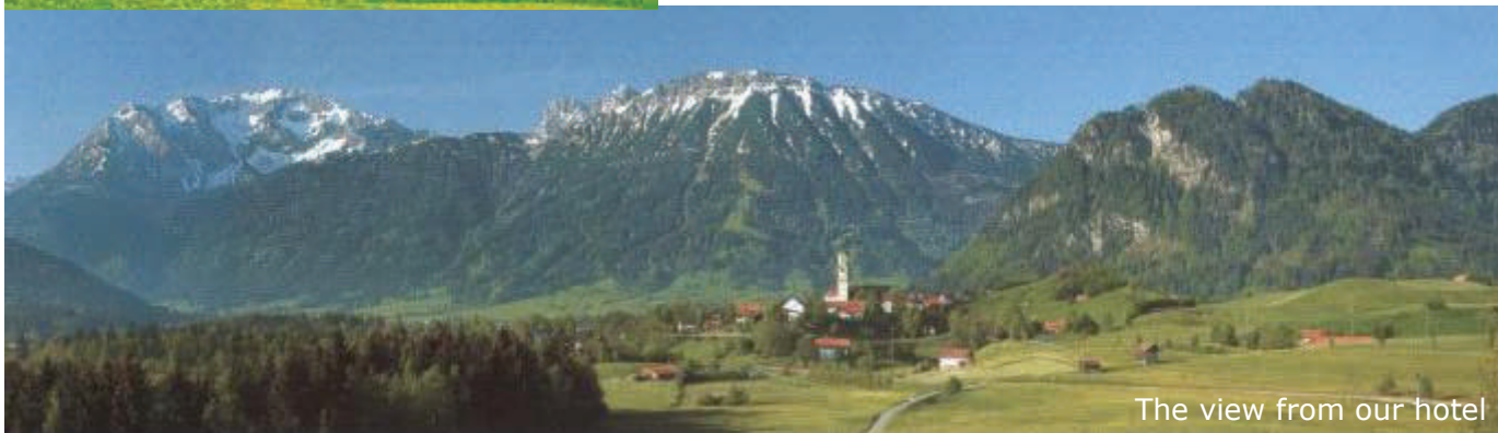
The view from our hotel

Sunday morning we open with a speaker meeting at 9 AM followed by our traditional candlelight closing ceremony.